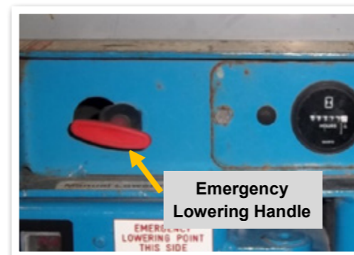
Emergency Lowering Handle for Gen 3 & 4