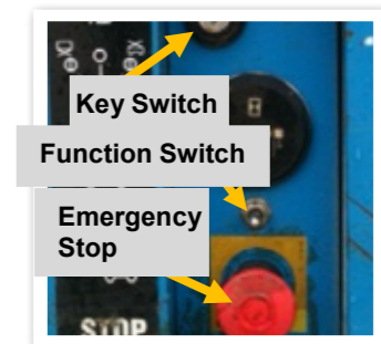
Lower Controls for Gen 5