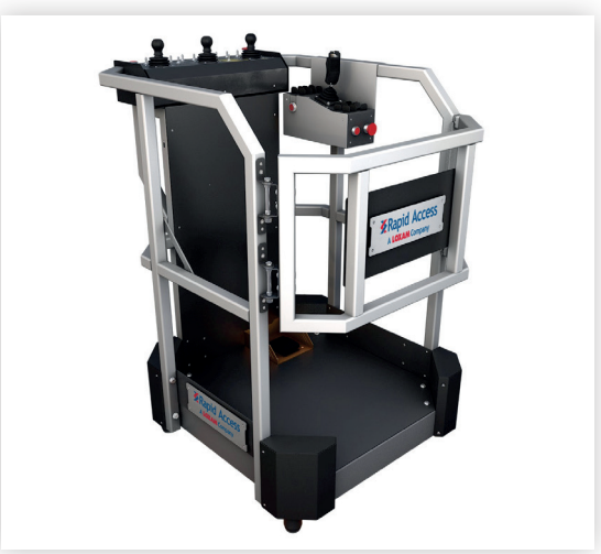
Virtual reality platform basket replicates MEWP controls and motion providing the trainee with physical sensation of elevation and movement